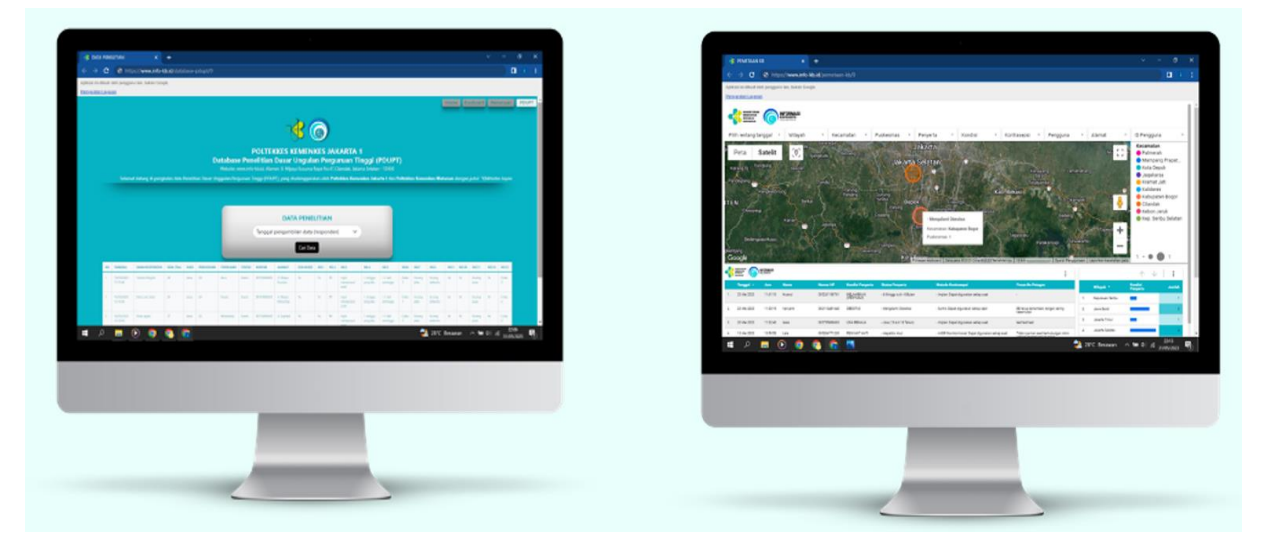
Figure 2. Display of data collection and respondent's residential area on the SITEPIS Contraceptives website.

To assess the functionality and usefulness of the website, the respondents at this stage were family planning officers consisting of midwives, PLKB, and family planning cadres who provide information services to the community at the sub-district and village levels in Bogor Regency and West Lombok Regency, totaling 28 respondents. The selection of respondents was carried out by purposive sampling. The research was conducted in June-July 2023. The data analysis used was descriptive analysis.